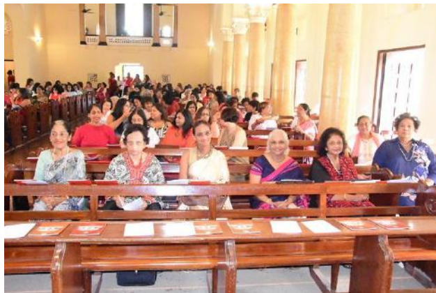
Past Presidents of the LC OGA