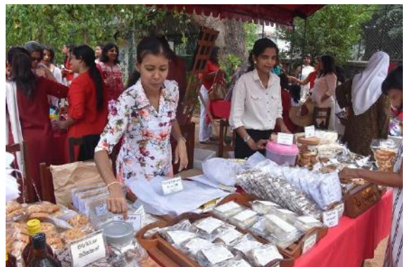
Sugar and Spice by Lakpahana by Chantal de Saram