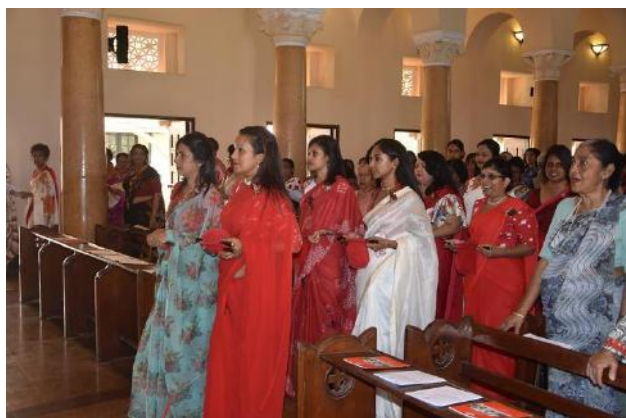
Members of the Executive Committee take up the Collection