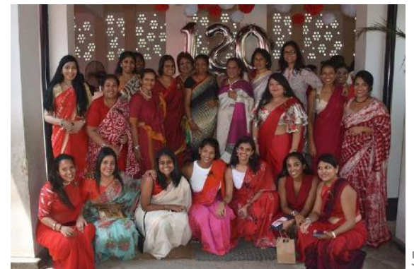
Members of the Executive Committee