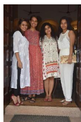
The LC OGA Choir