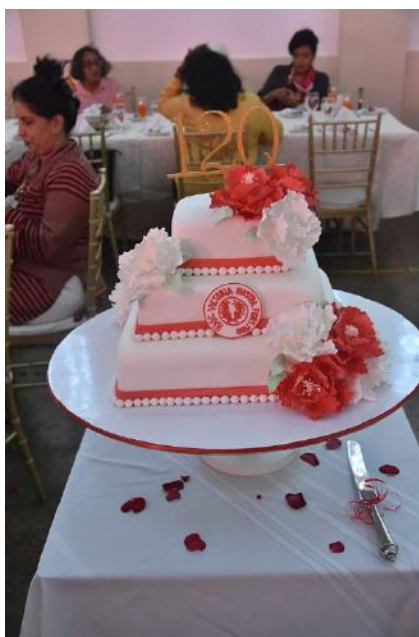
The beautiful birthday cake, sporting the school colours, of course!