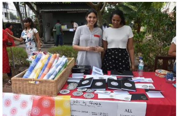
Inks by Shinks by Shiyanka de Zylva