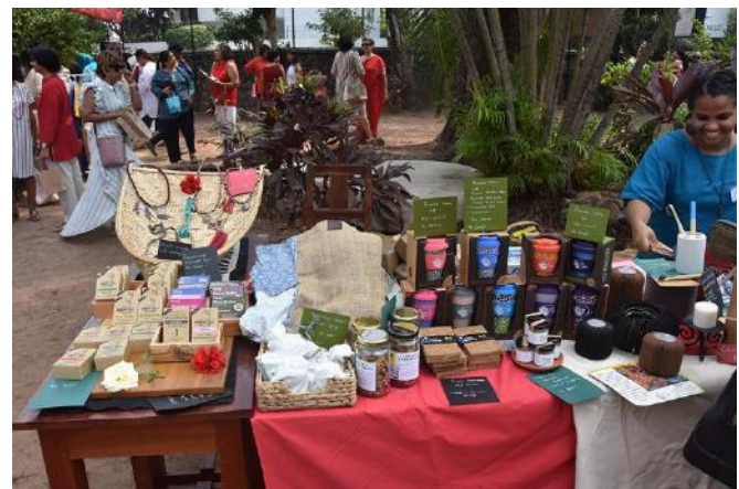
Bhumi by Shilpa Samararatunge